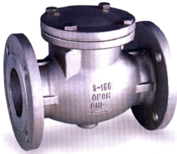
FIG. VT-WCF Class 150, Flanged ends, Bolted cover, 316 Stainless steel body & trim.

Flange dimensions: ANSI B16.5 Face-to-Face dimensions: ANSI B16.10 Wall thickness: ANSI B16.34/API 603 Testing: API 598