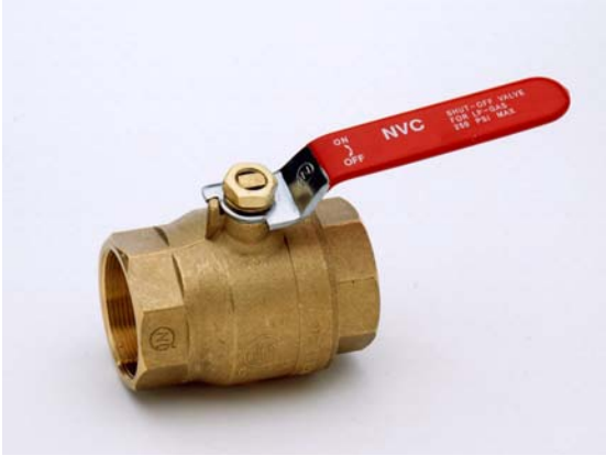
FIG: 320T- CU 2 piece, Full Port Ball valve, 600# WOG, NPT ends, PTFE seats

150# SWP, 600# WOG Meets MSS SP-110 Specifications Meets CSA ½ psi, 5 psi & 125 psi Specifications