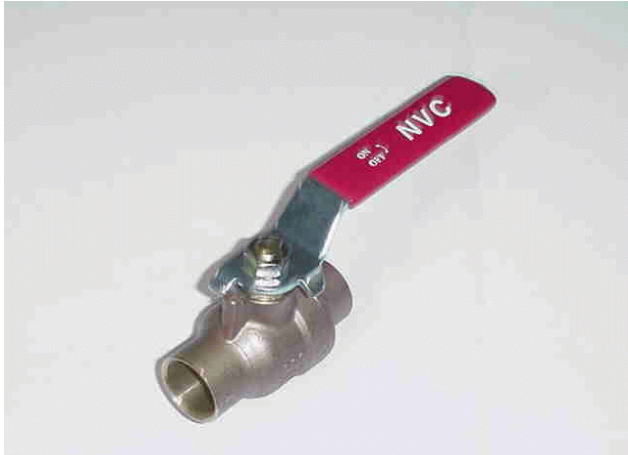
FIG: 320C 2 piece, Full Port Ball valve, 600# WOG, Solder ends, PTFE seats

600# WOG Meets MSS SP-110 Specifications